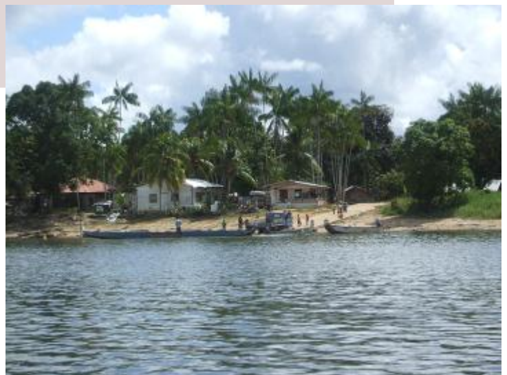
Villages along the Marowijne River